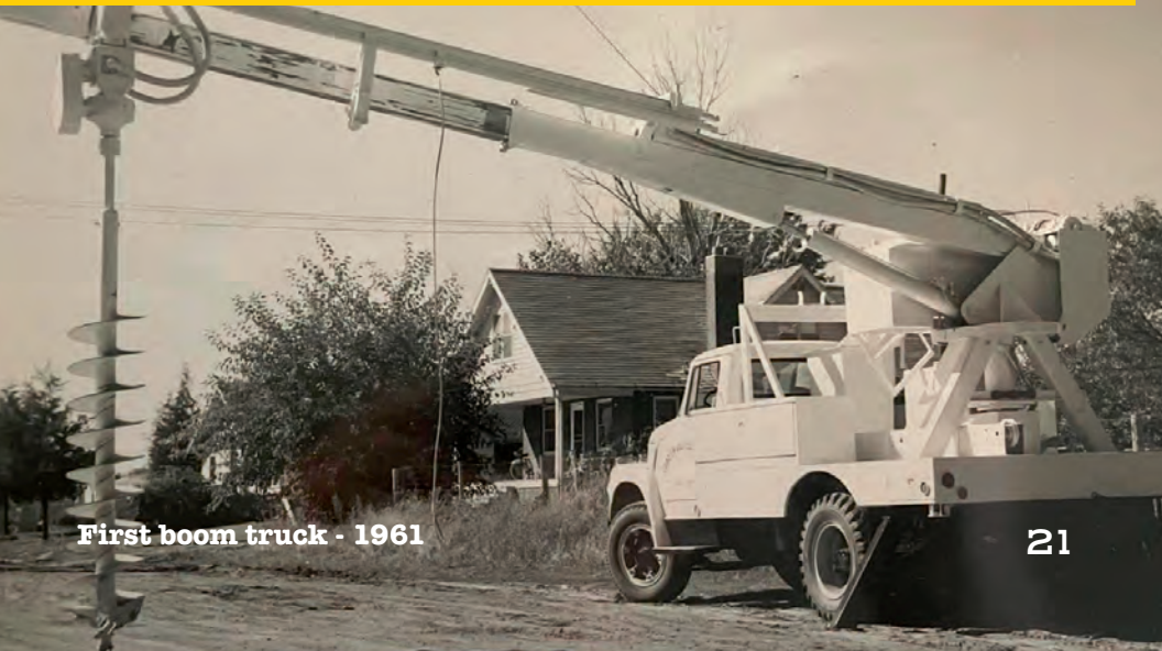
First boom truck - 1961