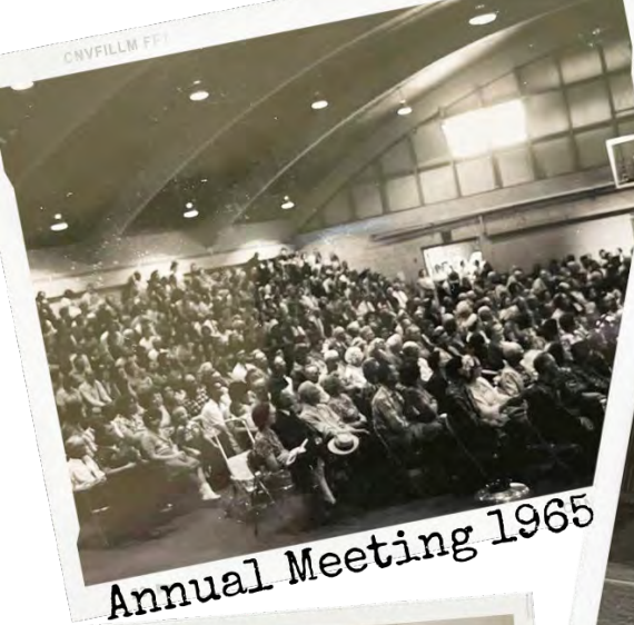
Annual Meeting 1965