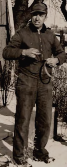
Installation of the first meter on Chariton Valley Electric Cooperative lines - Turner Farm January 20, 1947