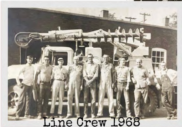
Line Crew 1968