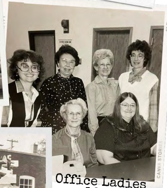
Office Ladies 1985