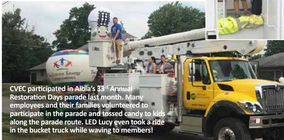
CVEC participated in Albia's 33 rd Annual Restoration Days parade last month. Many employees and their families volunteered to participate in the parade and tossed candy to kids along the parade route. LED Lucy even took a ride in the bucket truck while waving to members!