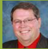
Norm Major District 5